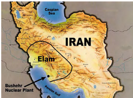
Elam = Central to Southwest Iran.