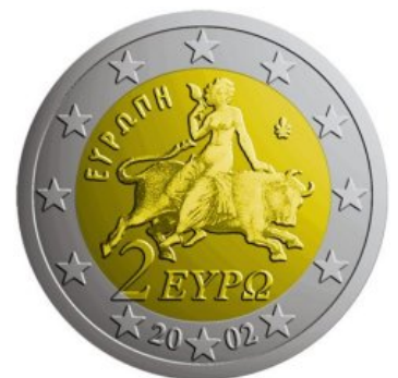
2 Euro Coin