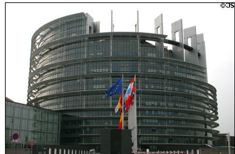
EU Parliament Building in Strasbourg (today)