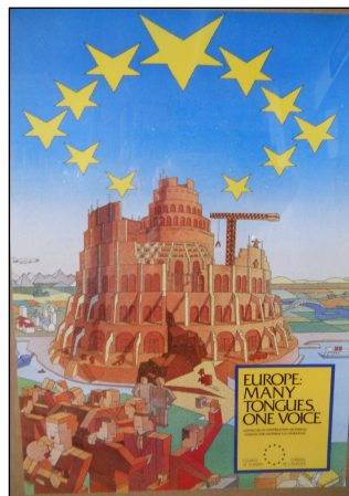
EU Parliament Construction Poster (1992)